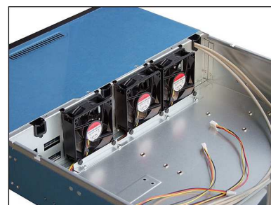
Three 80mm x 25mm Sunon 2ball bearing fans